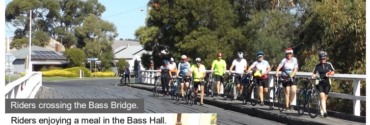
Riders crossing the Bass Bridge.