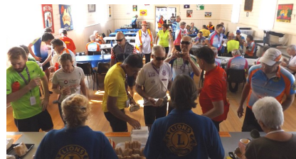
Riders enjoying a meal in the Bass Hall.

A very dedicated group of 55 cyclists set out on Wednesday 11 April from Tidal River on the 25th Lions Ride For Sight run annually. Although the four and a half day ride had to be cut short due to extremely dangerous winds and rain, the riders still managed to ride around 300km over three and a half days, raising funds for Lions Vision projects. The added incentive was the announcement at the pre-ride dinner on Tuesday evening that all funds raised would be doubled by CERA (Centre for Eye Research Aust.)