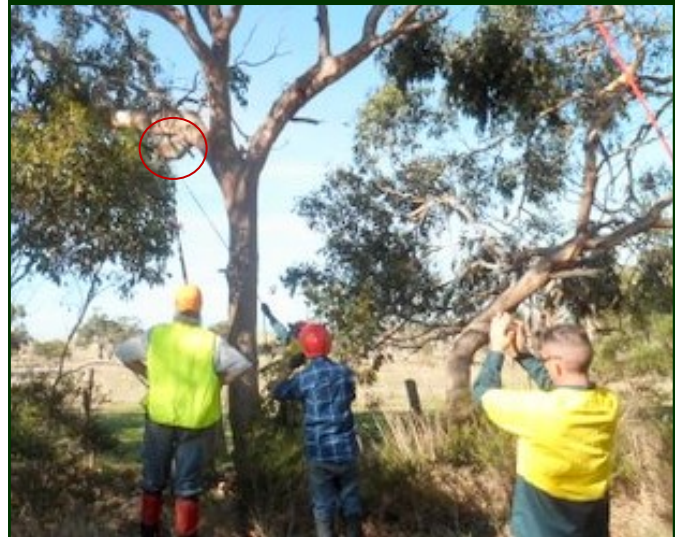
Rangers catching koalas for desexing to protect the environment.